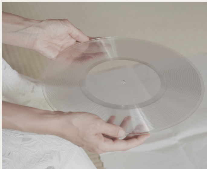
SOLSTICE, 2023 Lemos + Lehmann