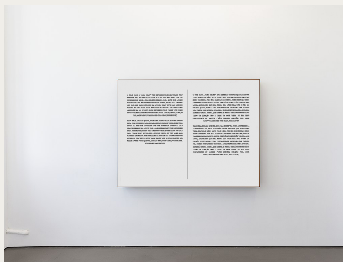
Mãos frias, mãos quentes, 2025 Bárbara Bulhão