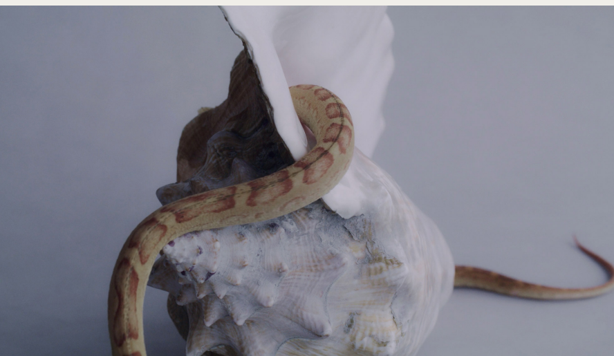
EN ALGÚN LUGAR / SOMEWHERE IN, 2021 Katherinne Fiedler

Through different languages — video, installation, photography, sculpture, drawing, sound, and site-specific practices — the artists brought together construct a field of reflection that moves between the intimate and the political, the individual and the collective, questioning the boundaries between freedom, identity, and social imposition.